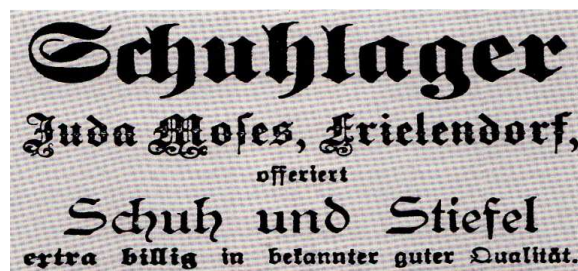
Homberger Kreisblatt, 15 Oct 1910 9