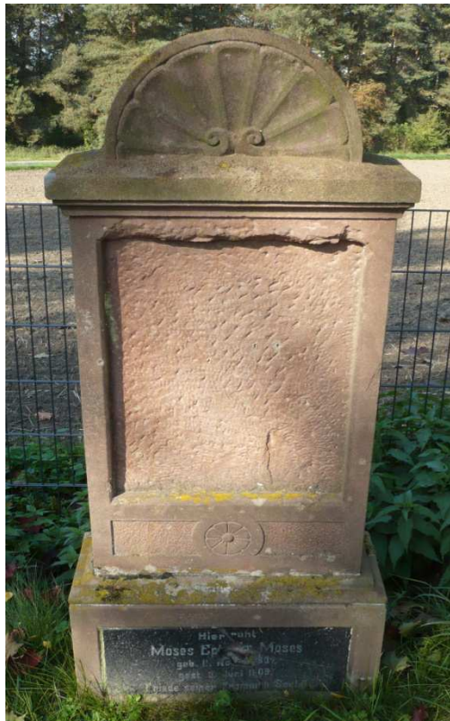
Moses Ephraim Moses