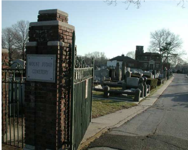
Mount Judah Cemetery, Queens, New York