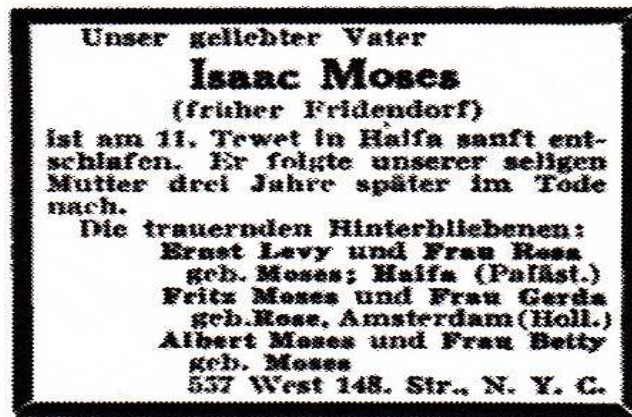
German Jewish newspaper AUFBAU , 11 Mar 1942